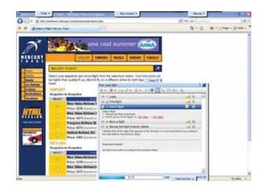
Figure 2. HPE Sprinter-raising the bar on efficient manual testing